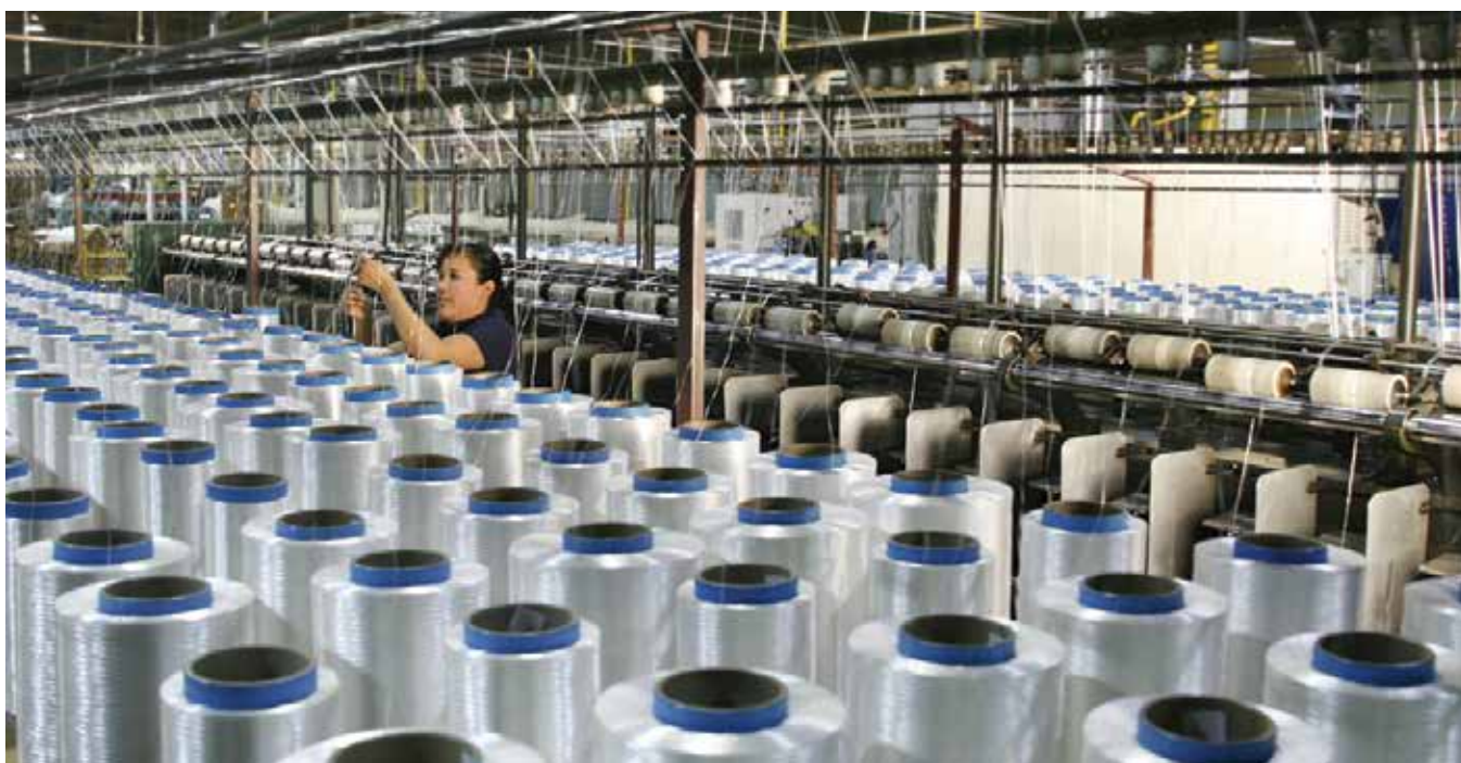
The ring twister combines multiple piles of high tenacity filament polyester yarns.