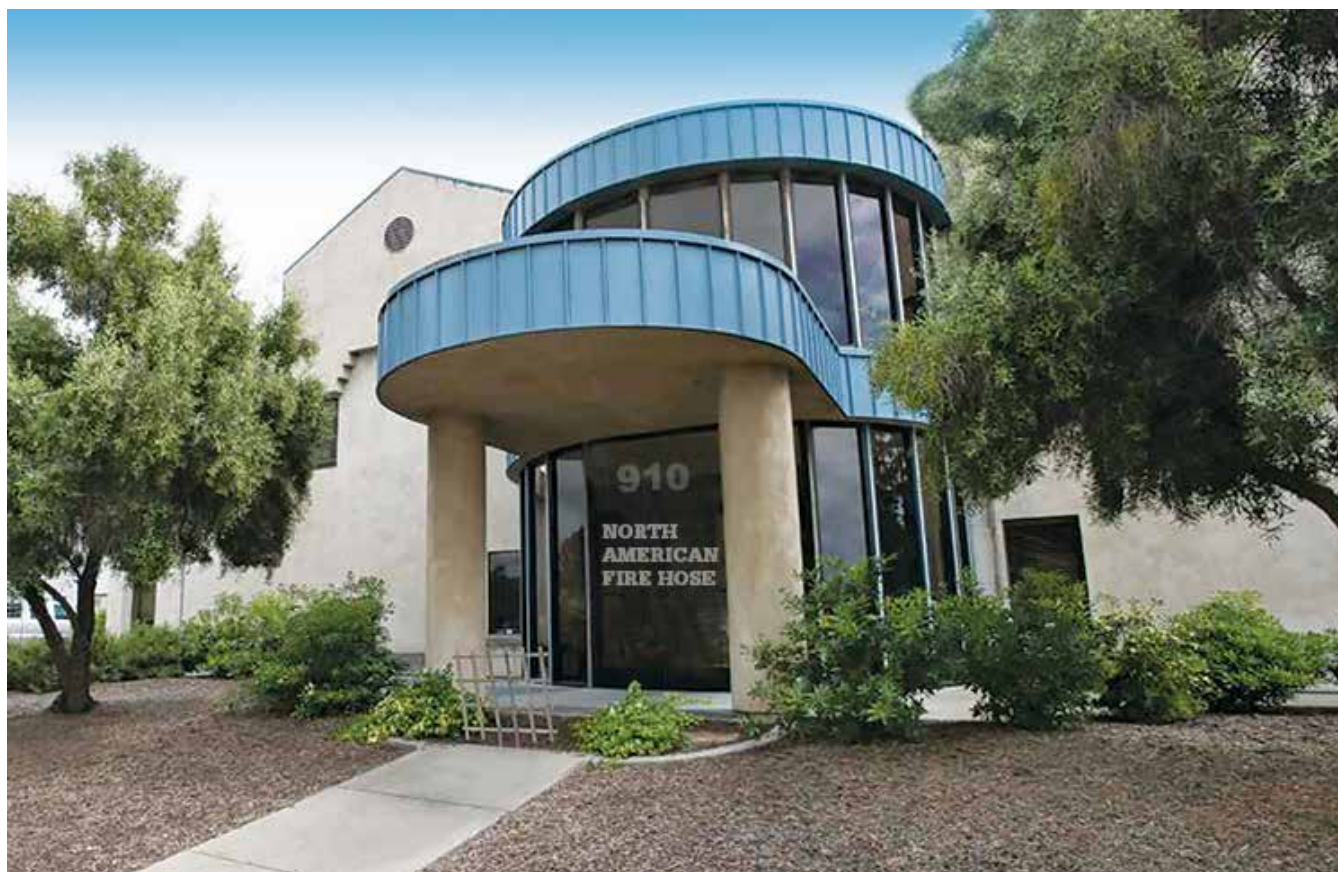
North American Fire Hose Corporate Headquarters