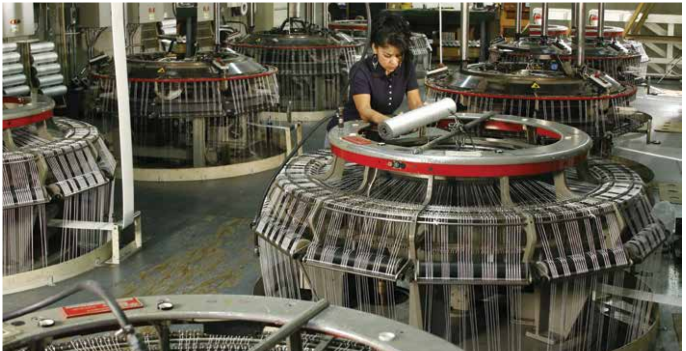
Our state-of-the-art weaving facility.